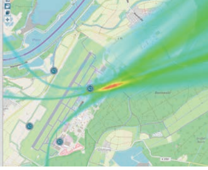
Localization of emissions using TDOA technology

From the Central Monitoring Software (CMS) software the user can manage the system, perform various kind of analysis on live and stored data and program automation. The system works in the frequency range from 9kHz up to 6GHz. It monitors the VHF spectrum, NAVAIDS, TETRA, GNSS, cellular systems and additional radio services and is capable to detect interference, jamming and system failures. With this proactive 24/7 monitoring approach airports can immediately react to interference and problems ensuring safe and reliable wireless communications.