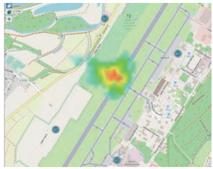
Localization of emissions using GROA+®

This setup features time difference of arrival (TDOA) and gain ration of arrival (GROA+®) based localization of RF emissions. Once a suspicious emission like interference is on air the system automatically sends out an alert and the source location can be calculated.