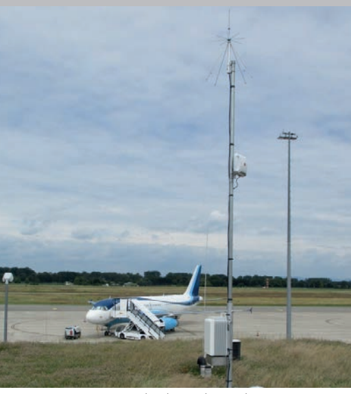
LS OBSERVER FMU at Karlsruhe/Baden-Baden Airport

// New approaches to achieve ubiquitous connectivity