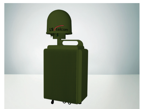
Fixed Monitoring Unit