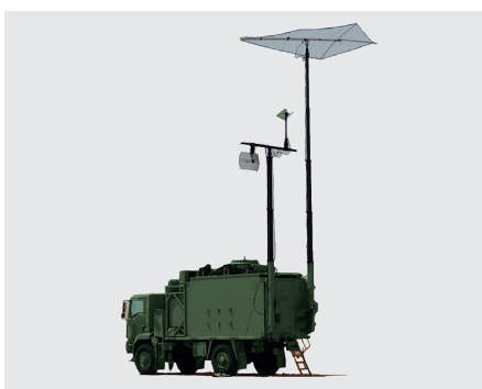
Mobile vehicle solution